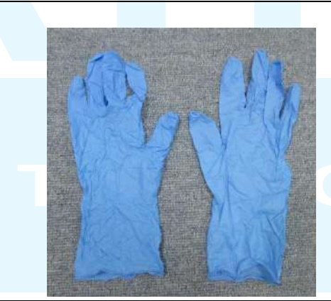
Samples described as Nitrile examination gloves, powder free, colour blue, referenced MD0120. Size S (6), M (7), L (8).