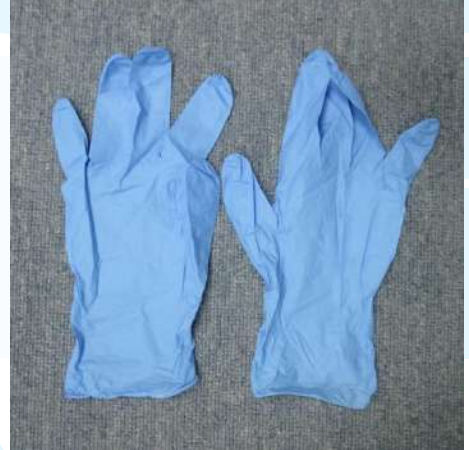
Samples of gloves described as Medcare examination gloves, powder free, color blue. Reference No. MD0120