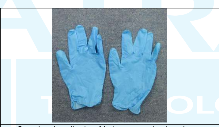
Samples described as Medcare examination gloves Powder free referenced as MD0120, Colour: Blue, size XL